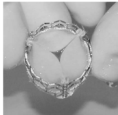
Figure 1. Upper view of the percutaneous heart valve, made of three leaflets of equine pericardium inserted within a stainless steel stent.

The following steps of valve implantation are shown in Figure 2. In the antero-posterior view, the valvular calcification and a frozen view of a supra-angiogram were used as markers to position the PHV at the mid-portion of the native aortic valve. In the last four cases, accurate positioning was further facilitated by the use of a 7-F Sones catheter advanced from the left femoral artery over the same guide wire and placed in contact with the distal end of the delivery balloon catheter. The Sones catheter also prevented antegrade dislodgement of the delivery balloon during inflation. Using a 10/90 contrast/saline solution, PHV delivery was obtained by maximal balloon inflation followed by rapid deflation. To improve the precision of PHV implantation, in Patients 3 and 5, rapid cardiac pacing (200 to 220 beats/min) of the right ventricle was undertaken during PHV delivery to decrease aortic blood flow and prevent the risk of PHV migration during balloon inflation. The delivery balloon and the guide wire were withdrawn immediately after PHV delivery. Hemodynamic assessment and supra-